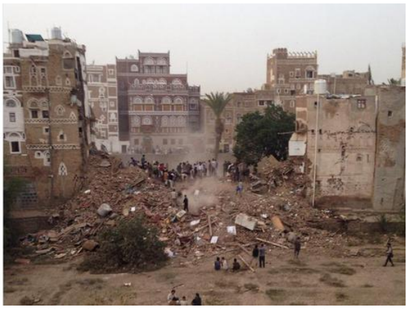
We will talk about what this year- old war is all about a little bit later. First let me talk about Yemen's history and its people.