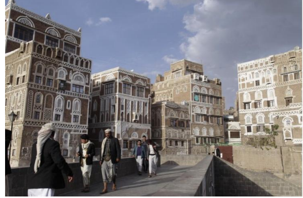
Here is what it looks like today after Saudi bombing:

The old city of Sana'a which is Yemen's capital, is a World Heritage site.