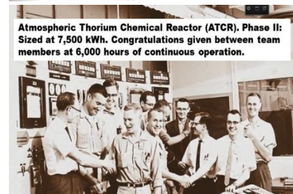
Atmospheric Thorium Chemical Reactor (ATCR). Phase II: Sized at 7,500 kWh. Congratulations given between team members at 6,000 hours of continuous operation.