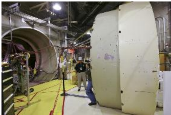
Reactors Destroyed by Nukes

The authorities lied about the 9.0 quake -- made it up out of whole cloth. An earthquake did not cause the tsunami. There must have been another cause.